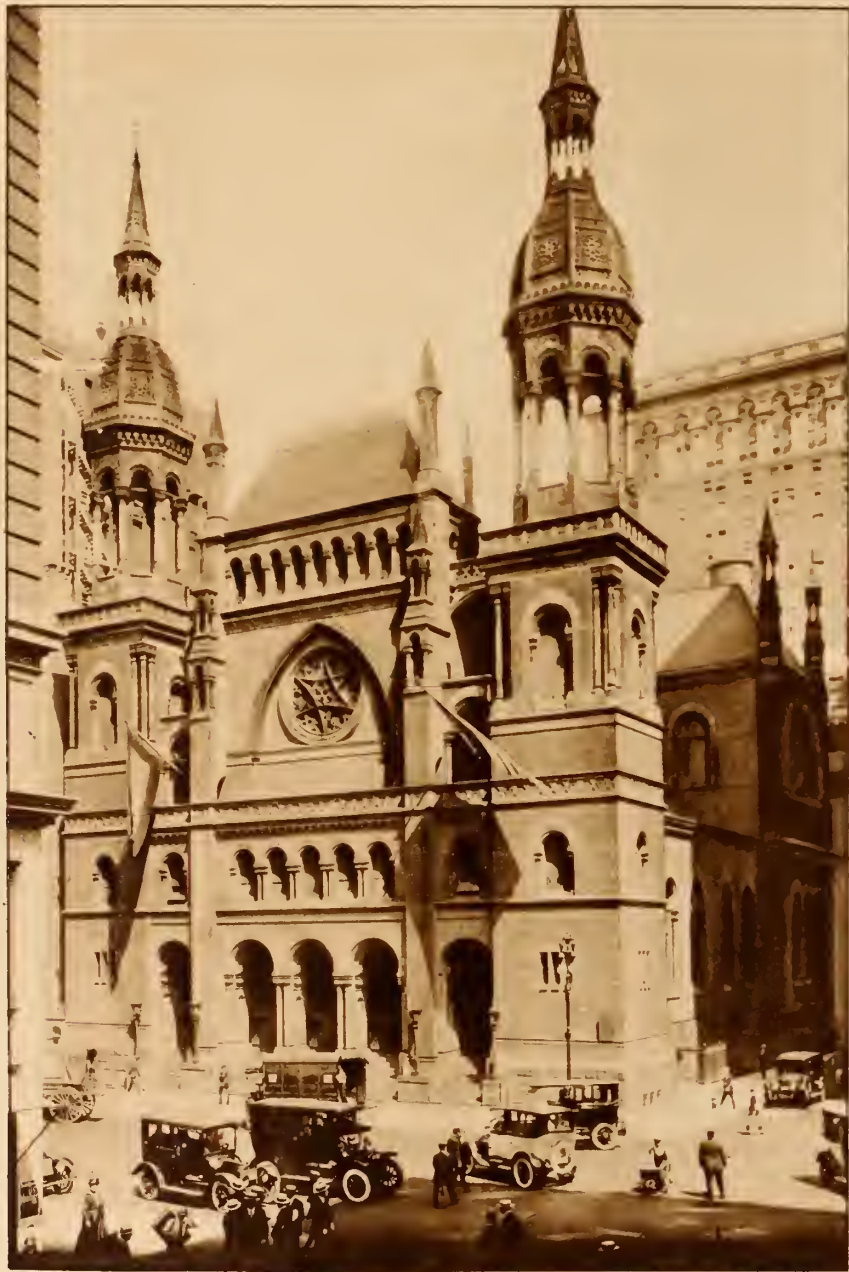
TEMPLE EMMANUEL. Synagogue at corner of 5th Avenue and 43d Street. One of the costliest religious structures in the city. Built of brown and yellow sandstone.